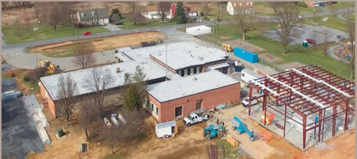
Aerial view of the Mount Joy Twp Municipal Complex under construction