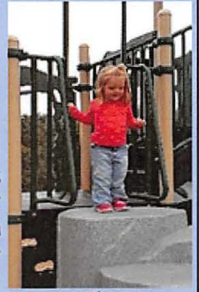
Large Play Area Cove Outlook Park