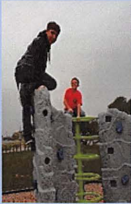
Climbing Wall Cove Outlook Park

All park pavilions can be rented by the day; the cost for a Mount Joy Township resident is $15 and for a non-resident the cost is $25. If you are interested in reserving a pavilion for your next gathering, please call the Township office at 717-367-8917 or email vicki@mtjoypwp.org .