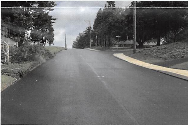
Above: Newly reconstructed N. Plum Street Below: Storm sewer discharge to local creek