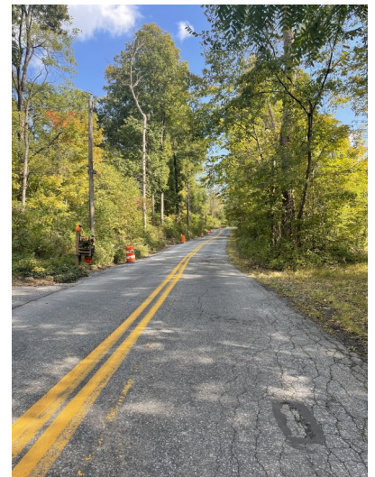
Third and final segment of Trail Road North improvements underway

September marked a long-awaited step forward in the Conoy Creek Restoration at Green Meadows as site work recently began. This project accounts for a considerable portion of the required water quality improvements that Mount Joy Township is responsible for. The rest of our pollution reduction allocation will be satisfied by a similar, but larger, project taking place on the Conewago Creek. Big thanks go out to our neighbor and partner Londonderry Township for spearheading this multi-phase restoration project, Lancaster Conservancy for their key role in site acquisition, and multiple funding sources like the Lancaster County Commissioners and Lancaster Clean Water Partners.